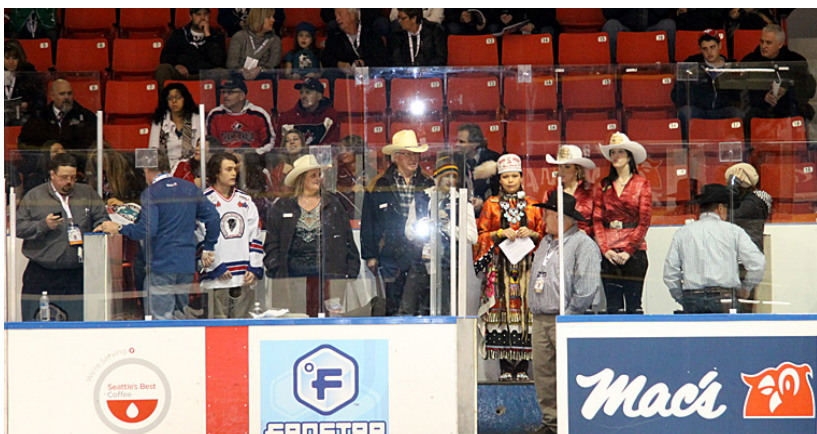
The Opening Ceremonies kicked off the volunteer-run Mac's AAA Midget Tournament